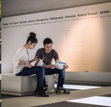
Students in the Information Centre