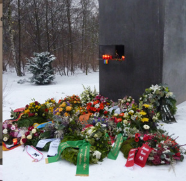
Memorial to the Homosexuals