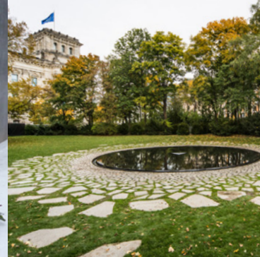
Memorial to the Sinti and Roma