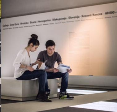
Students in the Information Centre