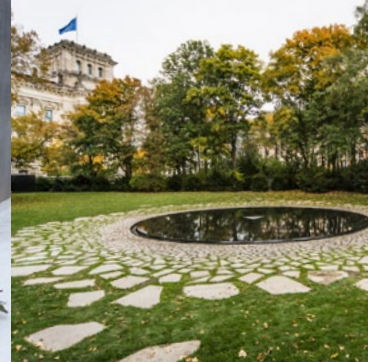
Memorial to the Sinti and Roma