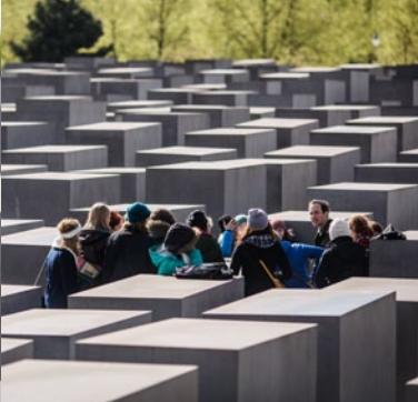
Visitors in the Field of Stelae