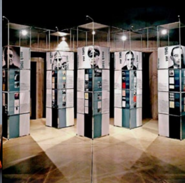
Travelling exhibition on Military Justice