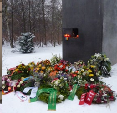
Memorial to the Homosexuals