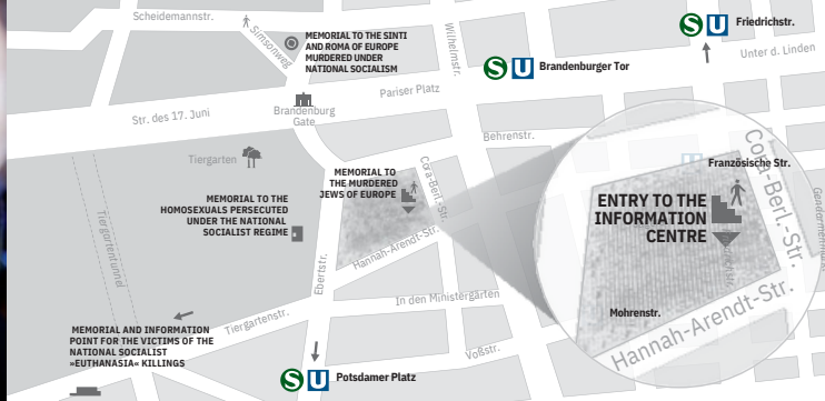
Location map and entry to the exhibition