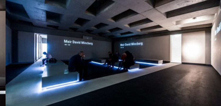
3 · Room of Names