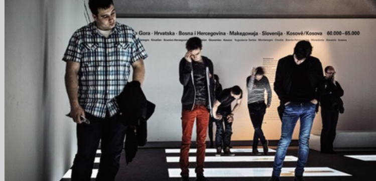
1 · Room of Dimensions