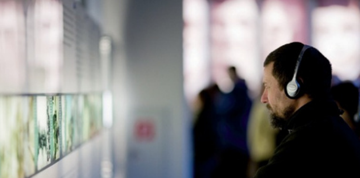
Visitor with an audio guide at the Information Centre