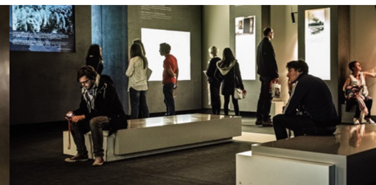
4 · Room of Sites